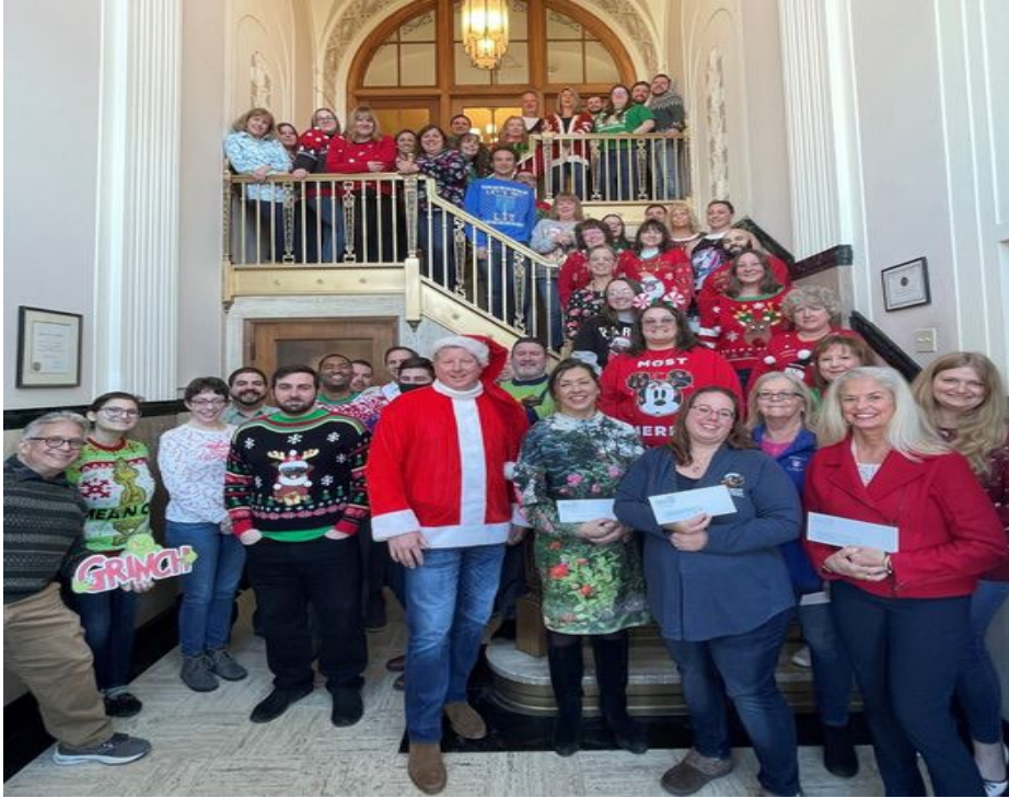
Staff of the Bank of Greene County opted to donate to organizations, including ours, rather than exchange gift on their "Ugly Sweater Day"