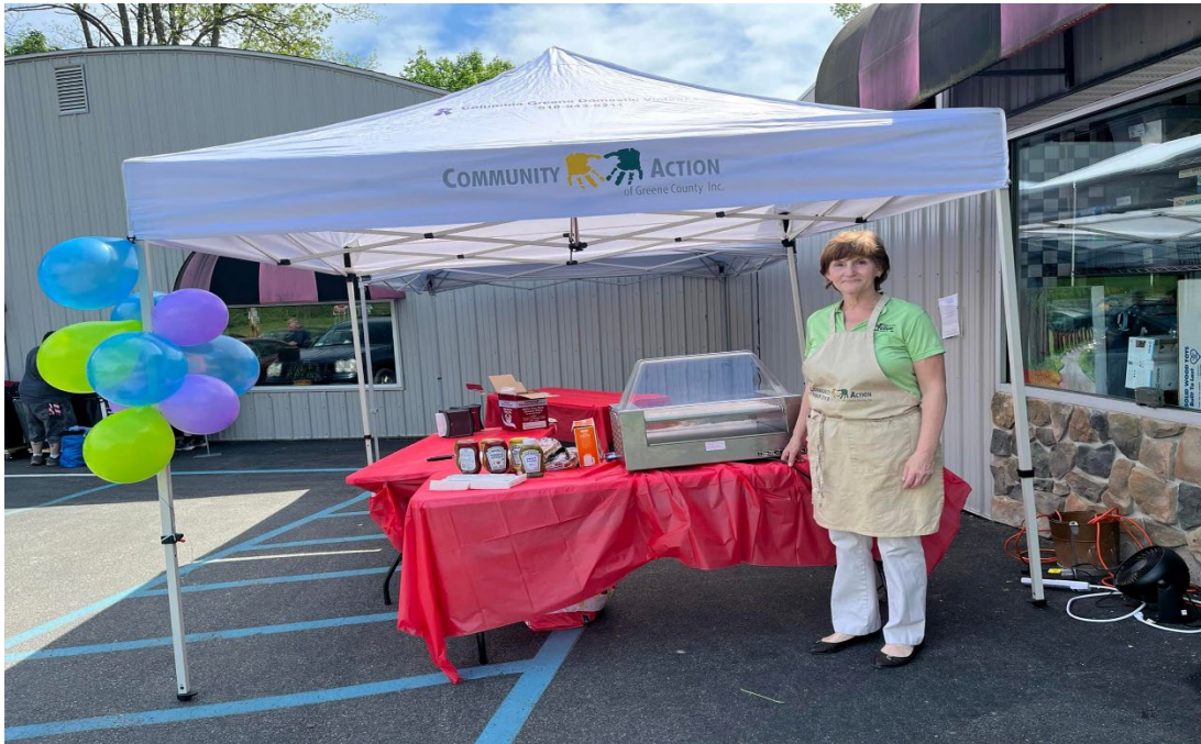
Free hot dogs and face painting was offered to community members to celebrate Pay it Forward Thrift Store's 10 th anniversary!