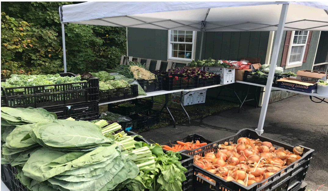
Free Farm Stand Tuesday provides fresh, local produce during harvest season to residents of Greene County