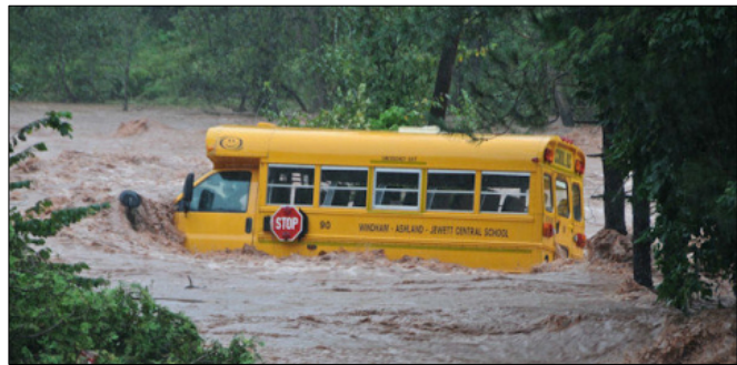
Flooding in Windham