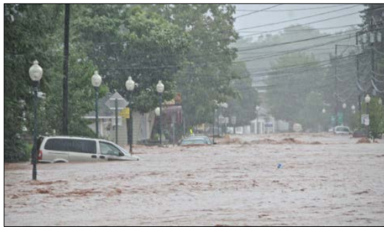
Flooding during Hurricane Irene