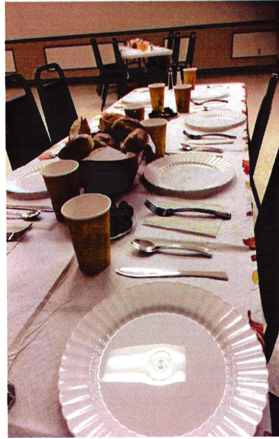
130 people were served at our 2nd Annual Community Thanksgiving Dinner. The dinner, open to all in the community, is a partnership between this agency and the Catskill Elks Lodge #1341.