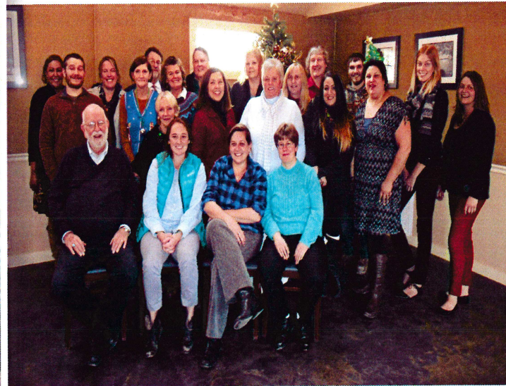
Community Action Employees enjoyed a wonderful lunch and fellowship at the Creekside for our 2017 Holiday