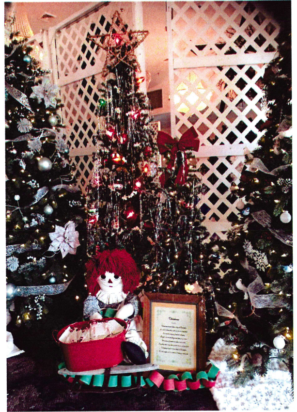
A Christmas to Remember– Each year we decorate a tree at the Festival of Trees to inform the community of our services. This year, our display brought viewers back to the simplicity and nostalgia of days gone by....popcorn and cranberry garland, paper chains.....thank you to the women of Fortnightly for all of your efforts in planning and executing this amazing event!