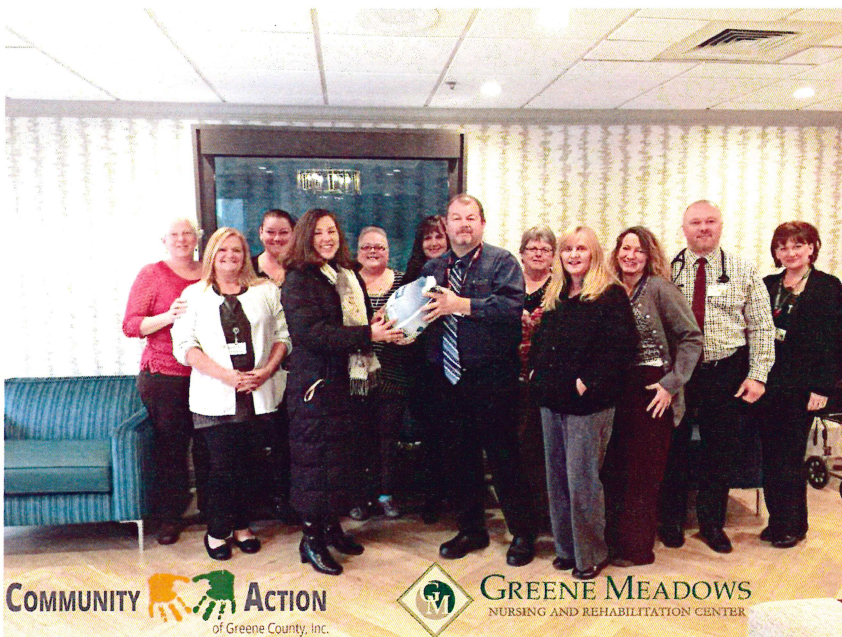
Greene Meadows Nursing and Rehabilitation Center donated 26 turkeys to Community Action Of Greene County, Inc.